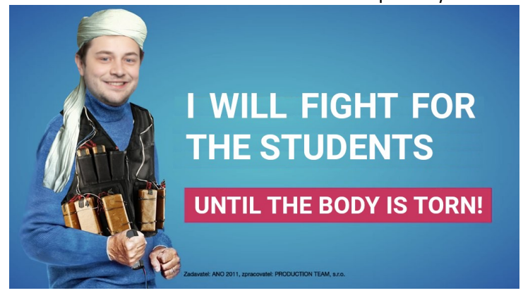
Figure 2: Politics is the art of compromise, but not at all cost.

Student mental health is the number 0 priority for me.