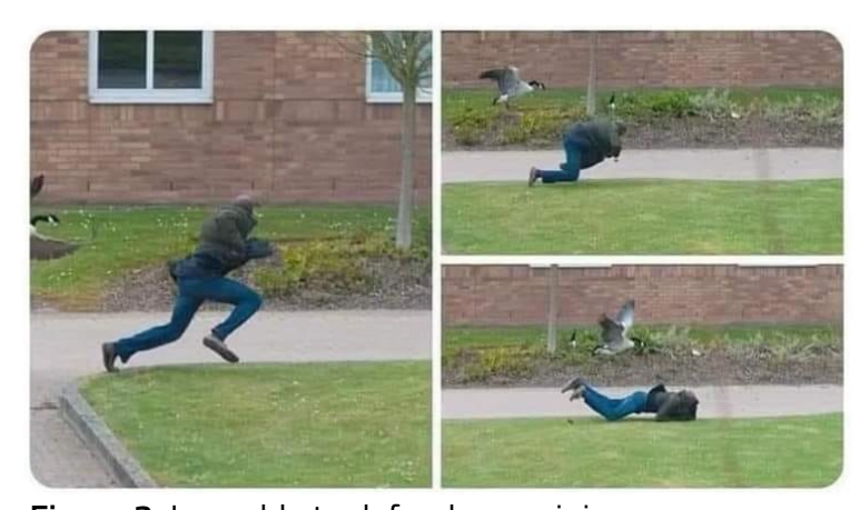
Figure 3: I am able to defend my opinions.

We've introduced Wellness Geese to campus to help students de-stress during the exam period.